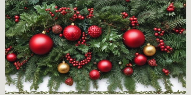
JOIN US AS WE PREPARE OUR SANCTUARY FOR THE ADVENT SEASON